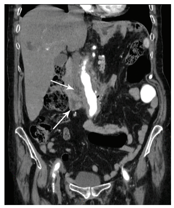
Figure 1 – Computed tomography of the abdomen, arterial phase, and coronal reconstruction. The arrows point to a densification of soft tissue around the aortic prosthesis, with gaseous images in between.

Splanchnic arteries were patent and the inferior vena cava showed normal caliber and contours. Lymphadenomegaly was evident in the great vessels chain (Figure 3).