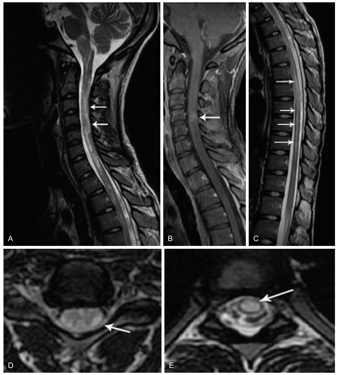
Figure 3 – Sagittal MRI images, ( A ) of the cervical spine weighted in T2 showing peripheral lesions (arrows), while those of thoracic spine are centrally distributed in ( C ) (arrows). ( B ) - sagittal T1 MRI image of the cervical spine after gadolinium injection showing slight enhancement of lesions (arrow). Axial T2 MRI images of de cervical ( D ) and thoracic ( E ) spines show hyperintense intramedullary lesions (arrows).

criteria appeared in the literature and some of them are presented in Table 2.<sup>7-11</sup> They could roughly be divided into three periods: the first period may be coined as the pre-MRI era in which the diagnosis was only based on clinical findings of spinal cord and/or optic nerve lesion at the same time that other diseases that shared similar neurological symptoms and signs were ruled out. The second period is characterized by the inclusion of MRI abnormalities, and the third period was defined by serum IgG-NMO status. Nowadays there is a growing trend to expand the NMO clinical spectrum.<sup>12</sup>