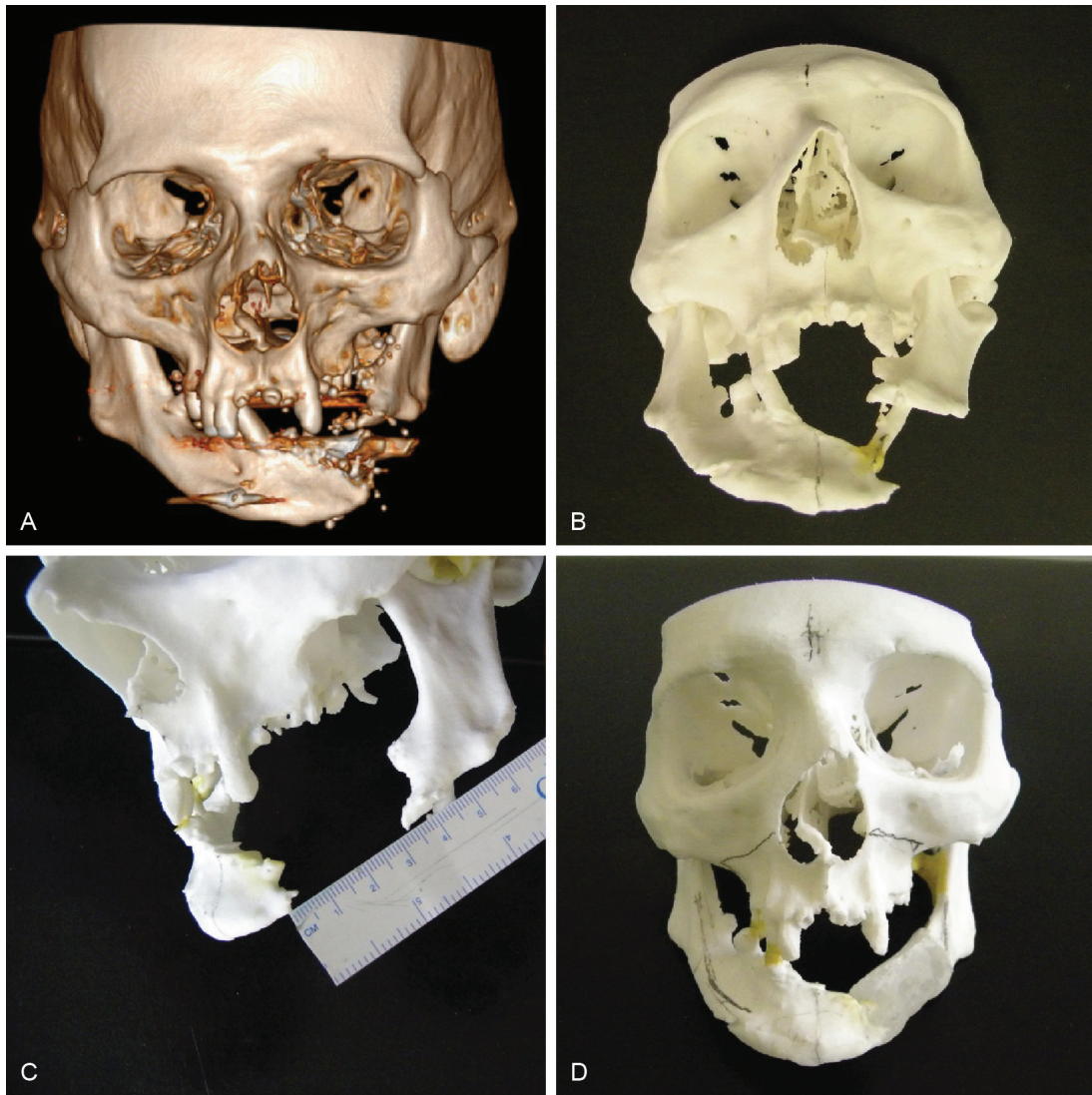
Figure 3. A - Frontal view of 3D CT reconstruction demonstrating the initial aspect of the mandibular fracture; B - Frontal view of the prototype, mimicking the CT image shown in A ; C - The segmental defect measured 5 cm; D - The acrylic was placed in the defect to re-establish the original anatomy of the mandible.