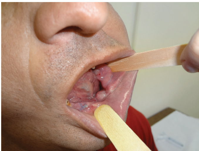
Figure 2. Intraoral aspect. It is possible to note the segmental defect between the wood spatulas.

tissue for the further insertion of implants. At the sixth month, the patient was referred for oral rehabilitation. Physiotherapy began with the objective of improving his maximal open mouth until 40 mm was reached and muscular function was re-established (Figure 6). Figure 7 shows the long-term postoperative aesthetics vision and the amplitude of mouth opening.