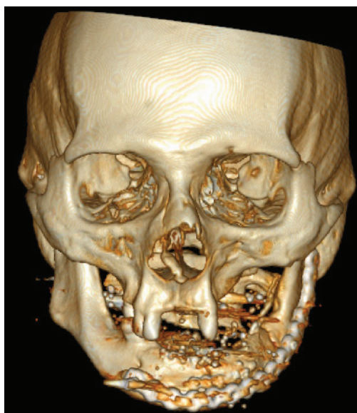
Figure 6. Five months CT – 3D reconstruction control; final aspect.

be fixed as a manner to stabilize the fragments and the three-dimensional mandibular format, 7 thus preventing excessive soft-tissue retraction.