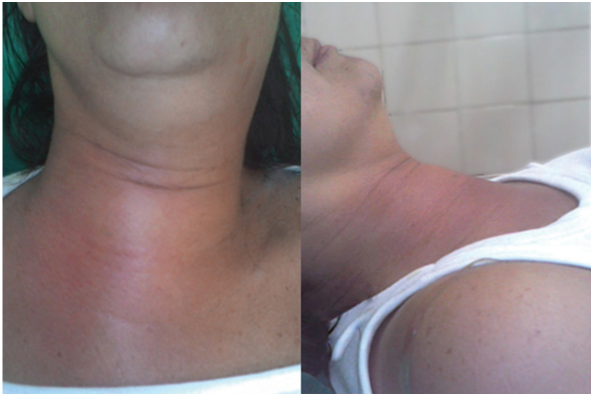
Figure 2 – Static physical examination (anterior and profile). Note the swelling and redness of the neck.

ceftriaxone (1 g every 12 hours), metronidazole (500 mg every 8 hours) and gentamicin (80 mg every 8 hours). After discharge from the ICU, the patient was hospitalized for two days in the infirmary until the removal of the tracheostomy tube, after which she was discharged to outpatient follow-up. Fifty-four days later, the patient underwent repair of