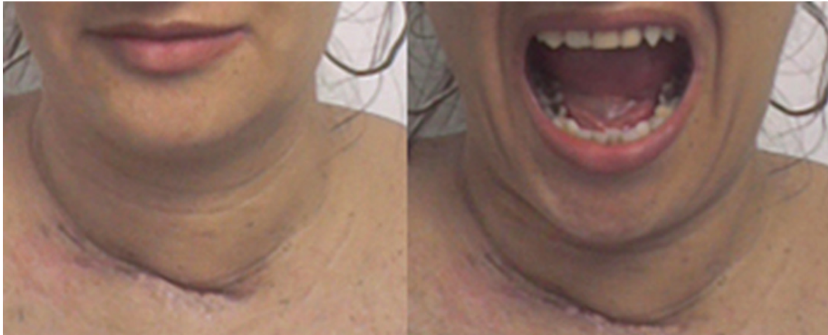
Figure 4 – Patient on post-admission day 41. Mouth opening to a near-normal extent (34 mm). Note the repair of the tracheal fistula.

the tracheal fistula (Figure 4) and was discharged on post-procedure day 7.