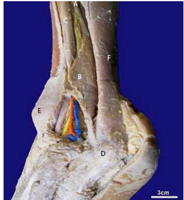
Figure 1 – Medial view of the right ankle showing at point A - the origin of ASM; B - ASM; C - flexor digitorum longus muscle; D - calcaneus; E - medial malleolus; and F - calcaneal tendon.

The supernumerary muscle was located in the posteromedial region of the ankle anteriorly to the calcaneal tendon and posteriorly to the medial malleolus, flexor digitorum longus, tibialis posterior, and flexor hallucis longus muscles. Its anterior face covered the posterior face of the tibial nerve, as well