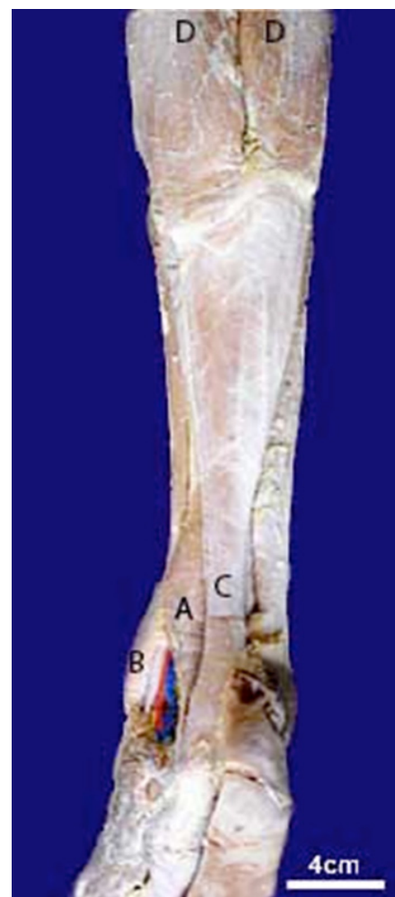
Figure 2 – Posterior view of the right leg showing at point A - ASM; B - medial malleolus; C - calcaneal tendon; and D - gastrocnemius muscles.