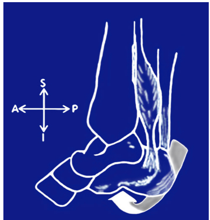
Figure 5 – Schematic illustration of the ASM action. S = superior; I = inferior; A = anterior; P = posterior.

The ASM observed in this report confirm other authors’ findings, 4,9-11 both in the origin and insertion of the supernumerary muscle. Five types of insertions have been described for this supernumerary muscle; namely: (1) insertion along the calcaneal tendon; (2) tendinous insertion on the superior calcaneal surface; (3) direct muscular